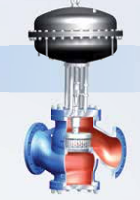
STEVI® Pro (Series 422/462, 470/471, 472)